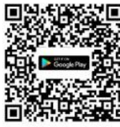
Android Android 8.0 ขึ้นไป