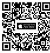
iOS iOS 14.5 ขึ้นไป